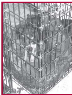
This poor momma and her pups are being kept in the garage because there is no other space available.